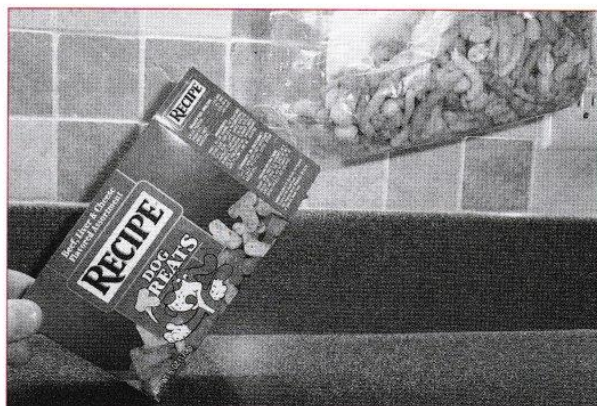
Figure 1 Replacing contents of box of dog-food treats with party mix.

Description: This activity would be ideal to use as a tool to introduce a lecture on diversity or cultural competence. It works best if implemented at the beginning of the semester. Purchase a box of dog-food treats, preferably a box that does not have a picture of the dog food on the box. Open the bottom of the box and empty the contents. Fill the box with something edible that resembles a dog treat as much as possible, such as coated nuts, party mix, or chocolate candy (See Figure 1). Be sure to discretely secure the opening of the box. To draw the students into the activity, briefly tell them a story about your dog (or the neighbor's dog if you do not have one) and how you enjoy purchasing treats for him or her. Improvise on the story as necessary. Ask the class if they have ever eaten dog treats, and then proceed to eat one. Ask if anyone would like a treat, as well. Observe their reaction. Usually, there are signs of disgust or surprise. Debrief the students on the truth. Next, relate their reactions to how people judge others by what appears on the outside, not what is inside.